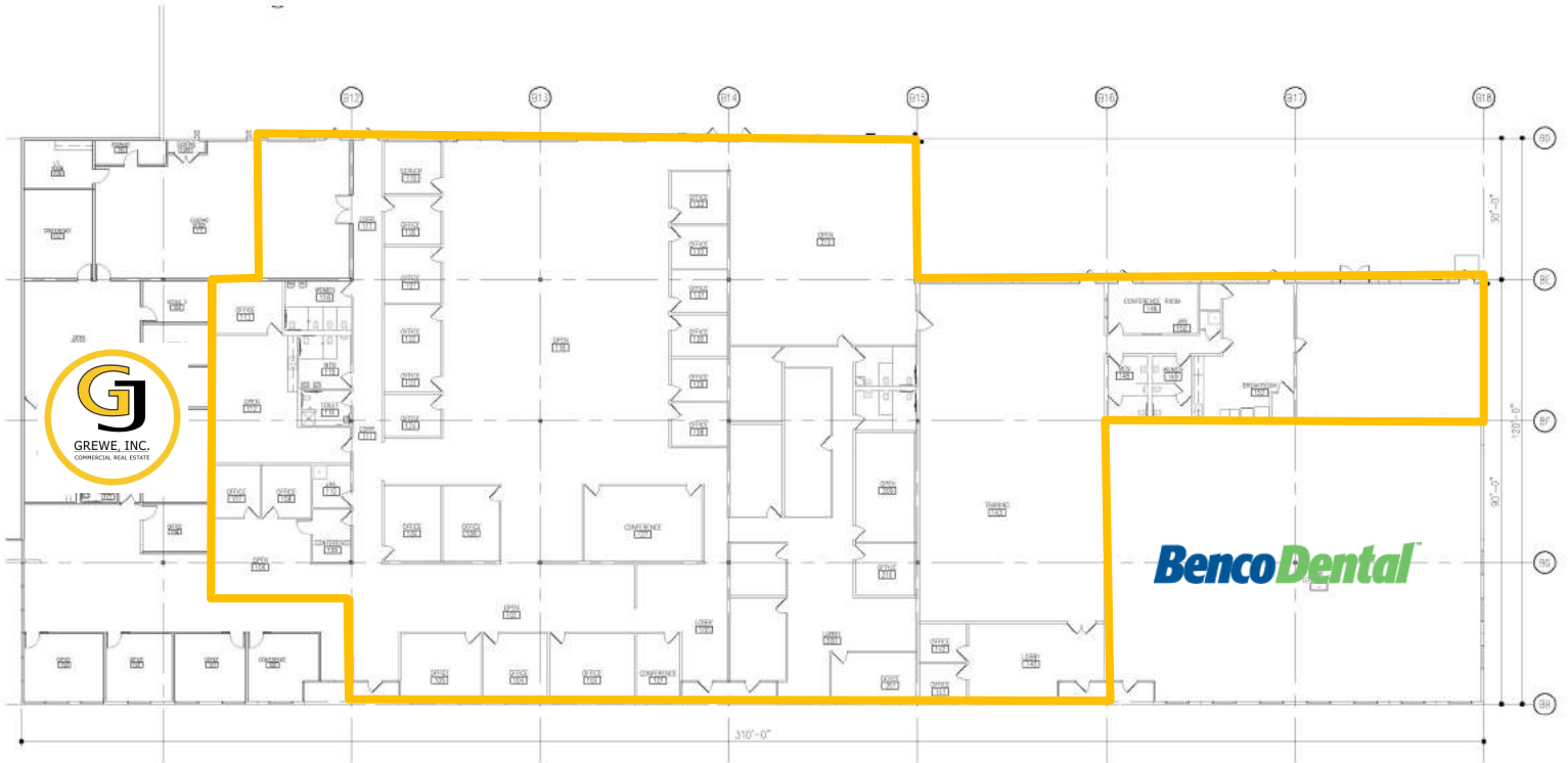
LEASE PLAN SCALE: 1" = 20'-0"